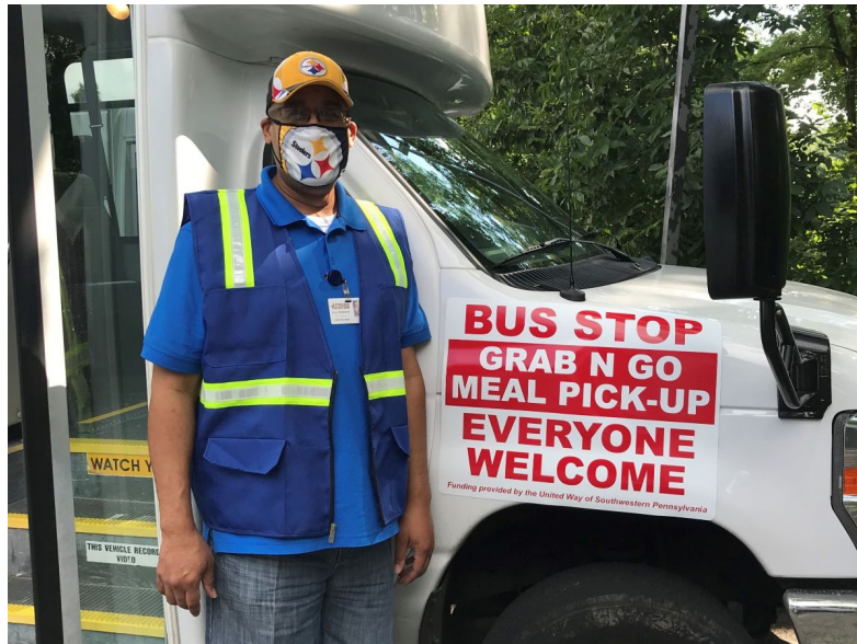
Figure 3: Marked delivery vehicle and driver

Overall, the prototype implementation has been considered successful by all stakeholders. As of early August, over 5000 school meals had been delivered, and it has recently been named as Metro Lab Network’s “Innovation of the Month” for August 2020 ( https://metrolabnetwork.org/projects/innovation-of-the-month/ ). Some pictures of the school lunch delivery program in action are given in Figures 3,4, and 5.