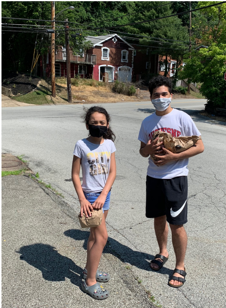
Figure 4: Two students receiving meals

In mid-August, the routes were tweaked slightly in anticipation of the approaching fall school semester, removing 4 stops that received very few customers and replacing them with 4 more promising locations. Current school district plans call for startup with virtual instruction and continuation of the home school meal delivery program through the fall of 2020.