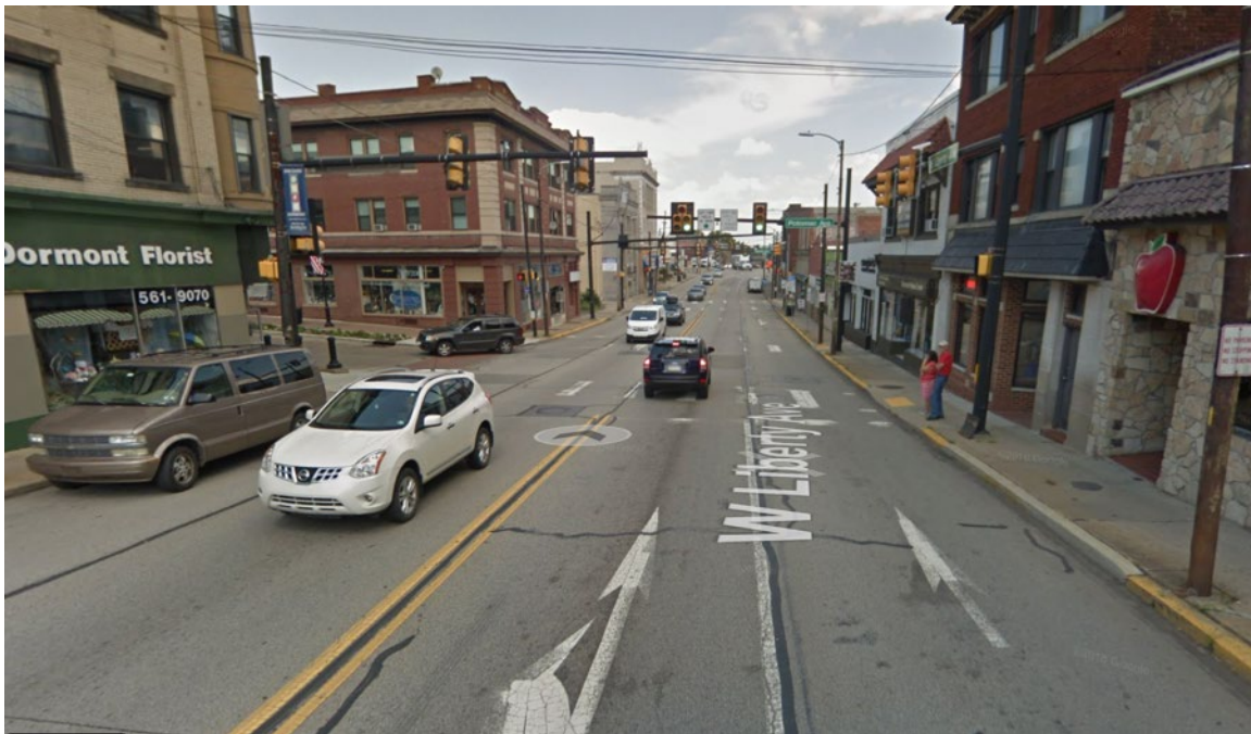
Figure 2: Business Rt 19 in mid-day through Dormont (note no cars parked in either curb lane).

Figures 2 and 3 are still shots from google streetview video that are intended to show the diversity of the corridor. Figure 2 is close to the northernmost point of the Business Rt 19 corridor in Dormont, and shows a business district with some onstreet parking lanes and 2-4 vehicular lanes of traffic (depending on time of the day and parking usage). Figure 3 shows the southernmost point of the corridor of interest, as it is exiting the Mount Lebanon business district and becoming a 4-lane highway through suburban neighborhoods and acting as a connector to other southern suburbs in Pittsburgh.