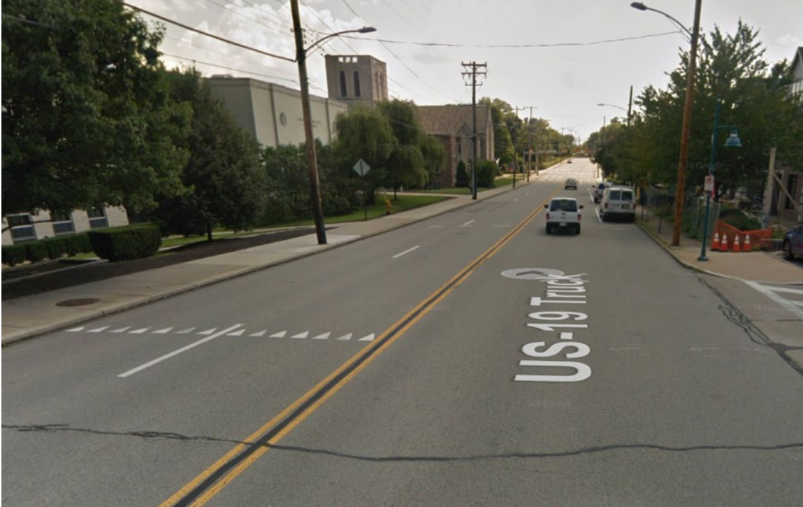
Figure 3: Business Rt 19 in mid-day through Mount Lebanon (note cars parked in southbound curb lane, a middle school on the left, and end of commercial district in the distance).

Overall, the Business Rt 19 corridor represents an excellent testbed for data-driven studies on mobility. With the two municipalities being very interested in smart mobility projects, there are many opportunities to have an impact and to spread the message to other interested partners in the area.